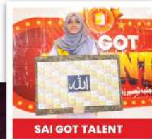
SAI GOT TALENT