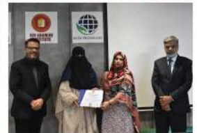
CAPACITY BUILDING TRAINING BY: BOARD OF INTERMEDIATE EDUCATION, KARACHI