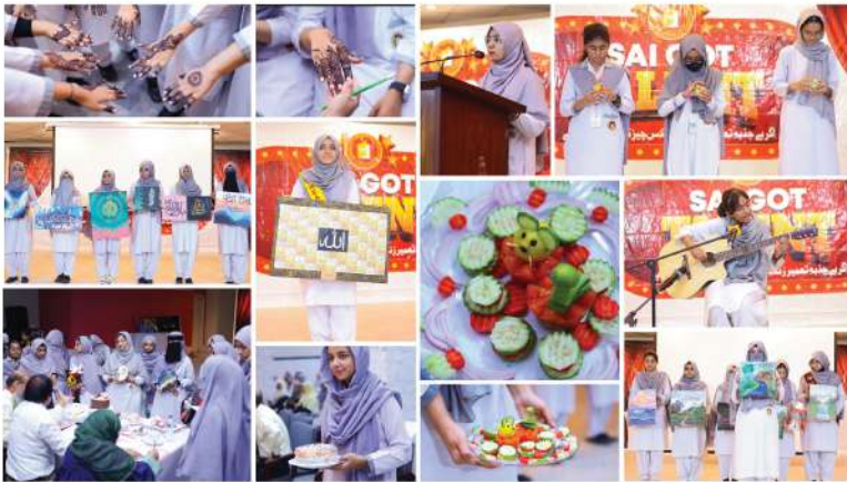
SAI GOT TALENT (GIRLS)