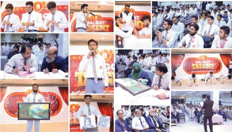
SAI GOT TALENT (BOYS)