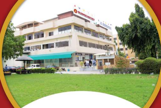
SIR ADAMJEE INSTITUTE