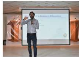
CAREER-COUNSELLING SESSION FOR ADMISSION IN TOP UNIVERSITIES IN PAKISTAN BY: ANEES HUSSAIN