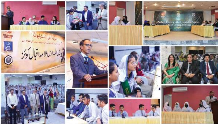
ALLAMA IQBAL QUIZ QUAID-E-AZAM QUIZ