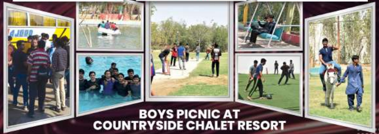
BOYS PICNIC AT COUNTRYSIDE CHALET RESORT