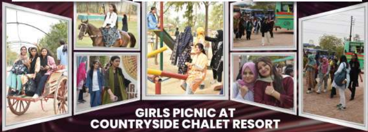
GIRLS PICNIC AT COUNTRYSIDE CHALET RESORT